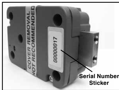
Figure 1 - Serial Number Label

The 8-digit lock serial number is located on a removable sticker on the lock case (See Figure 1.) Which is designed for the security professional in charge of this lock to peel off and place on the proper form. Since you may need the serial number of the lock to reset it if the combination is lost or forgotten and the door is open, it is important that you keep a record of the lock serial number in a secure place.